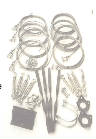
The 910 series Land Tower Kit above and Rigging Kit shown right.