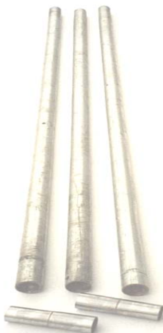
The 910 series Land Tower Kit above and Rigging Kit shown right.